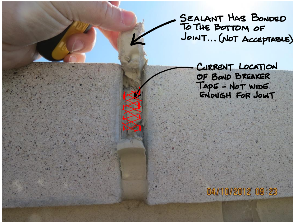
Photo above is a joint that sealant has been installed on top of a raked out mortar joint.